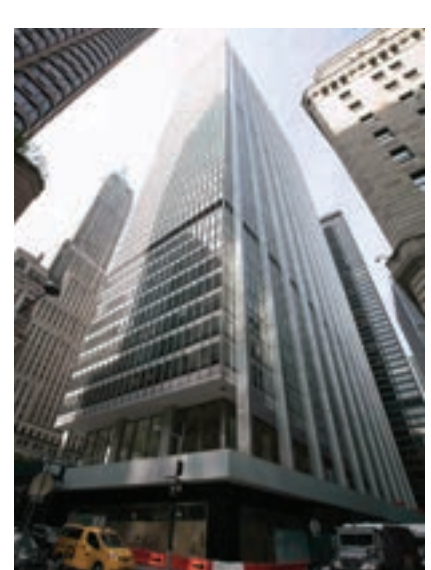
ADDRESS 28 Liberty St. SQUARE FEET 45,000

ADDRESS 250 W. 57th St. SQUARE FEET 46,583