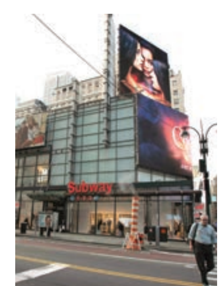
ADDRESS 435 Seventh Ave. SQUARE FEET 42,595