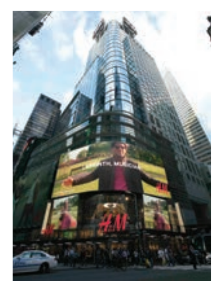
ADDRESS 4 Times Square SQUARE FEET 41,221